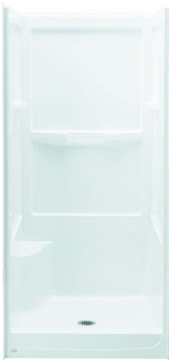
Model GR363 with 3660L/R and 3661 Wallset